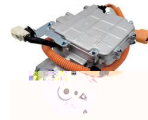
Air conditioning compressor controller